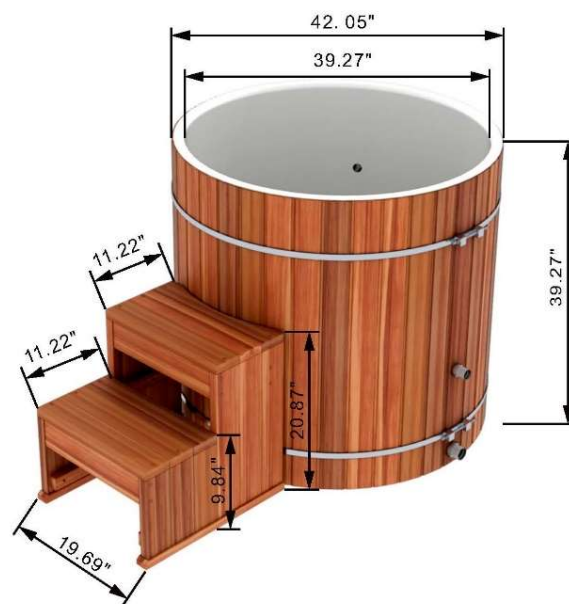
Barrell Tub w/Plastic Insert – 187 lbs Barrell Tub w/Metal Insert – 220 lbs