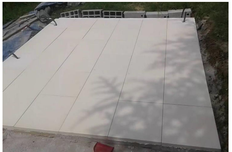
Patio Stone/Paver Blocks

It is recommended to build a base larger than required to provide a sitting area for cooling off during your sauna session.