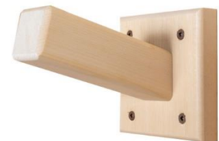
603022 Single Towel Hook (White Cedar)